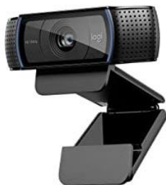
Logitech HD Pro Webcam C920, Widescreen Video Calling and Recording, 1080p Camera, Desktop or Laptop Webcam

Overall, the best webcam for video conferencing is by Logitech.