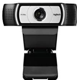
Logitech C930e 1080P HD Video Webcam - 90-Degree Extended View, Microsoft Lync 2013 and Skype Certified